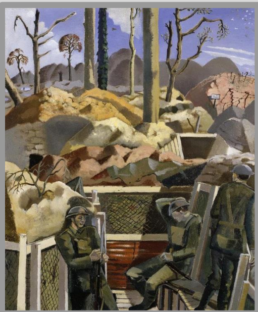
Spring in the Trenches, Ridge Wood, 1917. Paul Nash

Search and post your answers on the class blog: