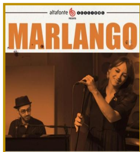
Figures 7 and 8. Images of the Dover and Marlango groups. The corresponding links are the following: < https://www.ecured.cu/Dover_(agrupaci3n_musical_espa1ola)#/media/File:DoverGmusical.gif >; < https://www.facebook.com/Marlangos/photos/a.429307800865/10156554954515866/?type=3heater >.