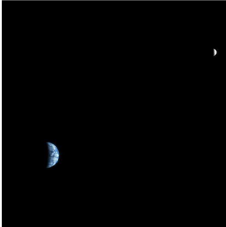
Figure 1. The Earth and the Moon from the planet Mars. The link to the image (public domain) is as follows: < https://upload.wikimedia.org/wikipedia/commons/b/b8/The_Earth_and_the_Moon_photographed_from_Mars_orbit.jpg >.

"There is nothing bigger than the sky, there is nothing stronger than the love, there is nothing like the planet Earth". The components of the Morgan band interpret a song to the feelings and the possibilities that the world offers.