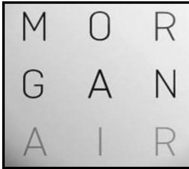
Figure 9. Logo with the name of the group Morgan and that of their second album, Air . The link is as follows: < https://wearemorgan.com >.

On the other hand, Spanish soloists have developed international careers in which the use of the English language has been common or of preferential use, among whom is the vocalist Russian Red.