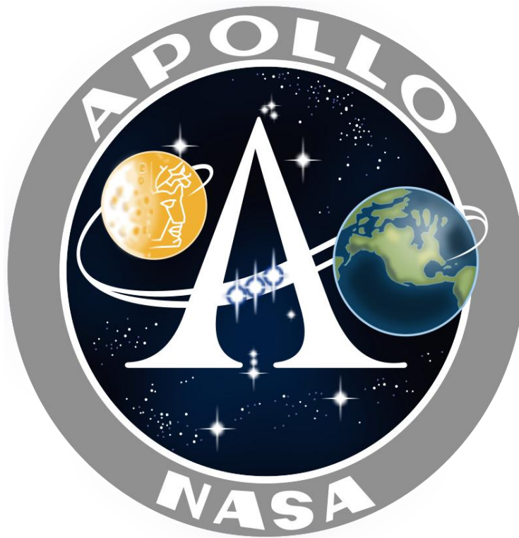
Figure 2. Image of the Apollo Aerospace Program insignia. Commemoration of the space adventure, 2017. The link to the image (public domain) is as follows: https://commons.wikimedia.org/wiki/Category:Apollo_program#/media/File:Apollo_program_insignia.svg .

https://www.nasa.gov/wav/62284main_onesmall2.wav .