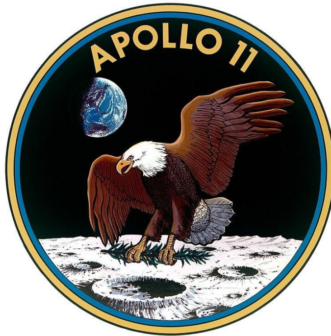
Figure 3. Apollo 11 mission insignia. The link to the image (public domain) is as follows:< https://commons.wikimedia.org/wiki/File:Apollo_11_insignia.png#/media/File:Apollo11logo.jpg >.

The Apollo 11 spacecraft carried a plaque describing the journey and its intention, as follows: