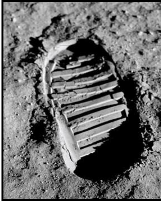
Figure 5. Footprint of the Apollo 11 pilot, Edwin E. [Buzz] Aldrin, July 20, 1969. The image, in the public domain, belongs to NASA, ID no. AS11-50-5877. It is available at the following link: < https://es.wikipedia.org/wiki/Apolo_11#/media/Archivo:Apollo_11_bootprint.jpg >.

Figure 4. Legend included in the ship sent to the Moon in 1969. Image available in the following link: < https://graffica.info/50-anos-desde-que-la-tipografia-futura-piso-la-luna/ >.