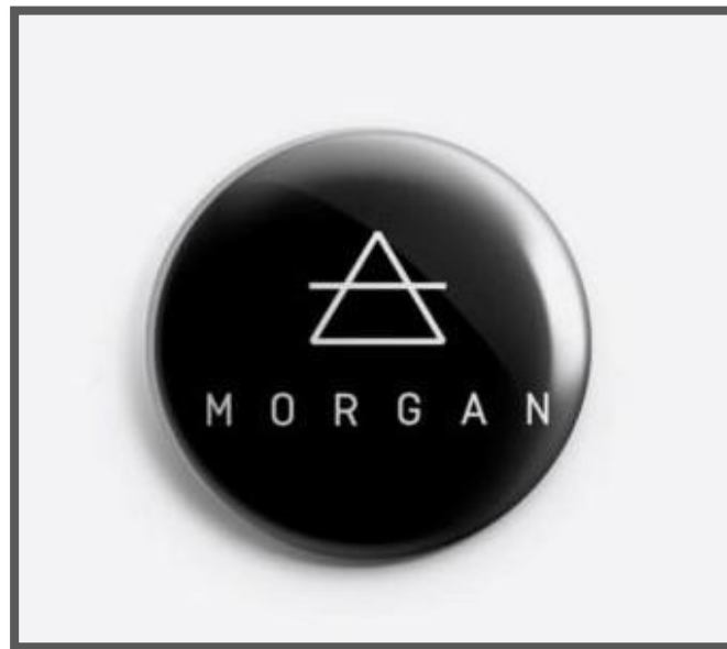
Figure 6. You can find out more about the band, their production and their concert schedule at the following link: < https://wearemorgan.com >.

The lyrics of their songs use English as the characteristic language of their production, with exceptions such as "Volver" included in the first album, North , and "Sargento de Hierro" in their second album, Air . They are not a rarity on the music scene, as other bands and performers release their music in that language. In this way, musicians from different backgrounds can alternate their performances by fusing styles and using different languages. Groups like Marlango (Alejandro Pelayo and Leonor Watling) or Nawjalean (Carlos Jean and Nawja Nimri) are made up of musicians who are accustomed to using different languages because of their biography. Groups like Dover (dissolved in 2016), among many others, have developed their career using the English language, while Corizonas (a fusion of the groups Coronas and Arizona Baby) has performed in English and Spanish. There are groups that alternate different languages naturally.